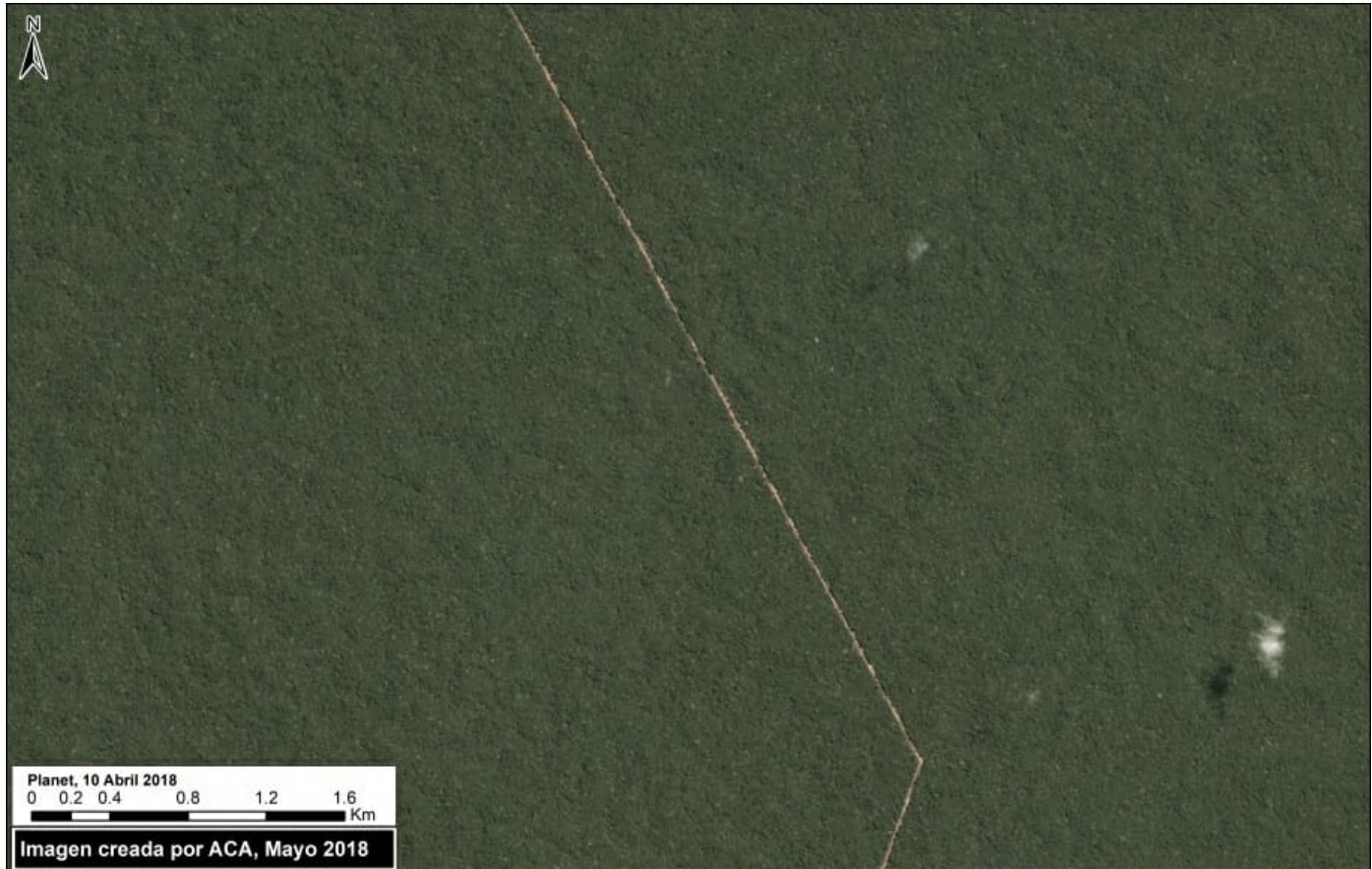
Image A: New Yurimaguas-Jeberos road crossing primary forest.

The efforts and international commitments of the Peruvian Government to reduce deforestation may be compromised by new projects do not have adequate environmental assessment.