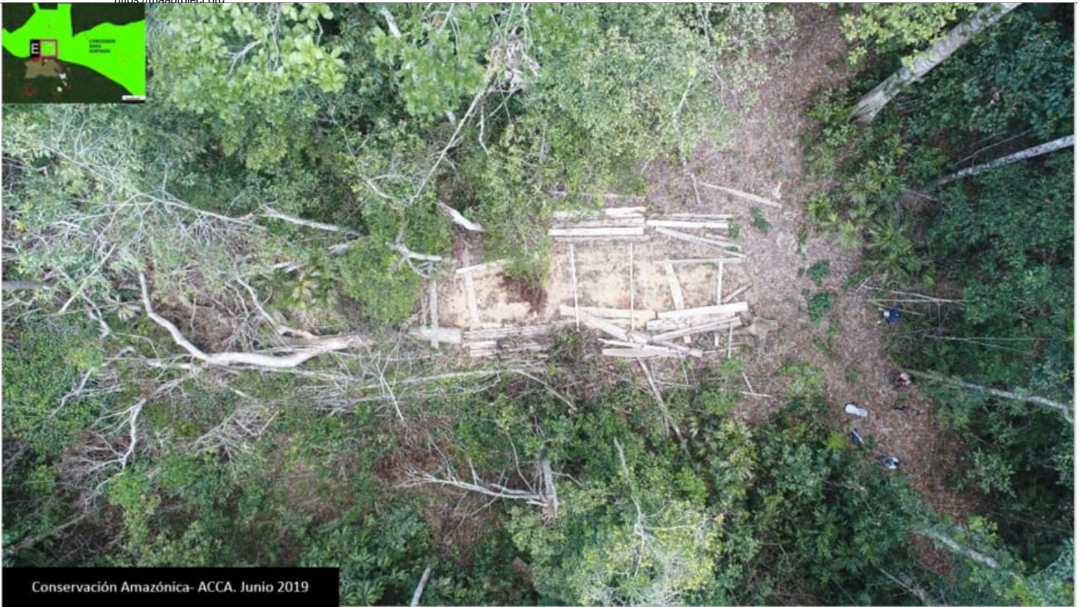
Case E. Illegal logging in the Forest Concession "Sara Hurtado" identified with drone images.