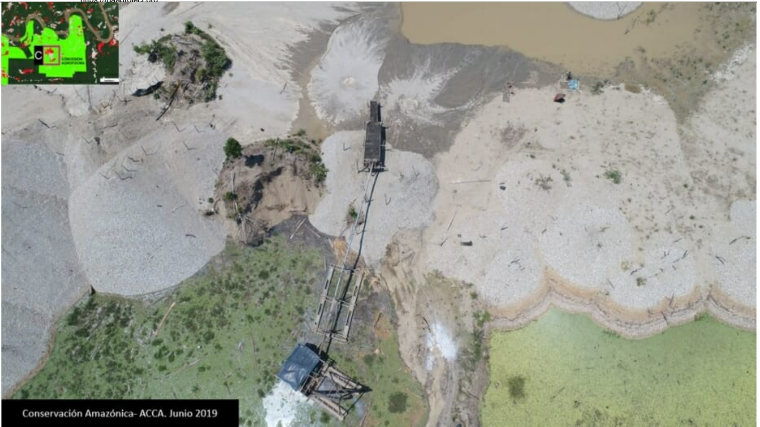
Case C. Illegal mining in the Forest Concession “AGROFOCMA,” identified with drone images.