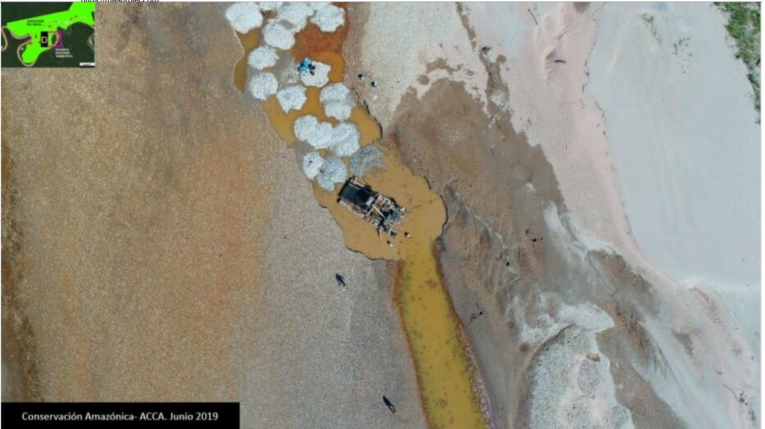
Case D. Illegal mining in the Forest Concession “Inversiones Manu,” identified with drone images.