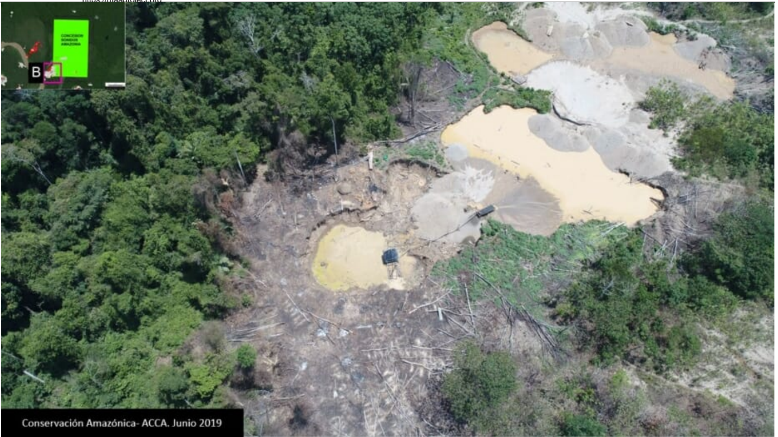
Case B. Illegal mining in the Tourism Concession "Sonidos de la Amazonía," identified with drone images.