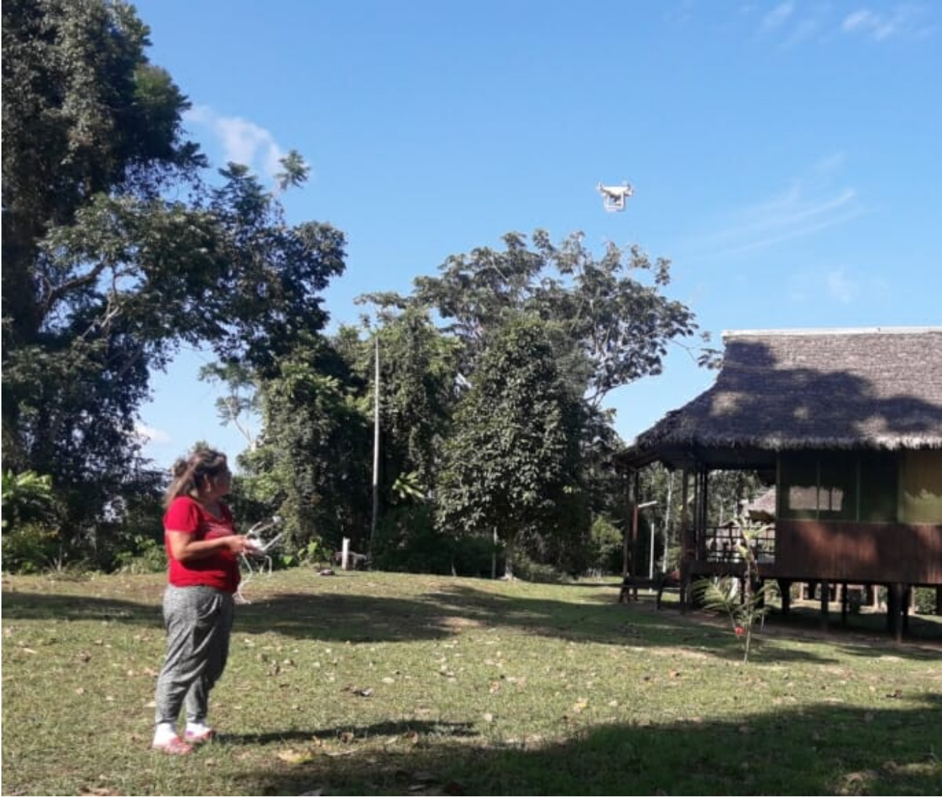
ACOMAT member flying a drone for monitoring.

Amazon Conservation , in collaboration with its Peruvian sister organization, is implementing a project aimed at linking cutting-edge technology (satellites and drones) with legal action , in the southern Peruvian Amazon (Madre de Dios region).