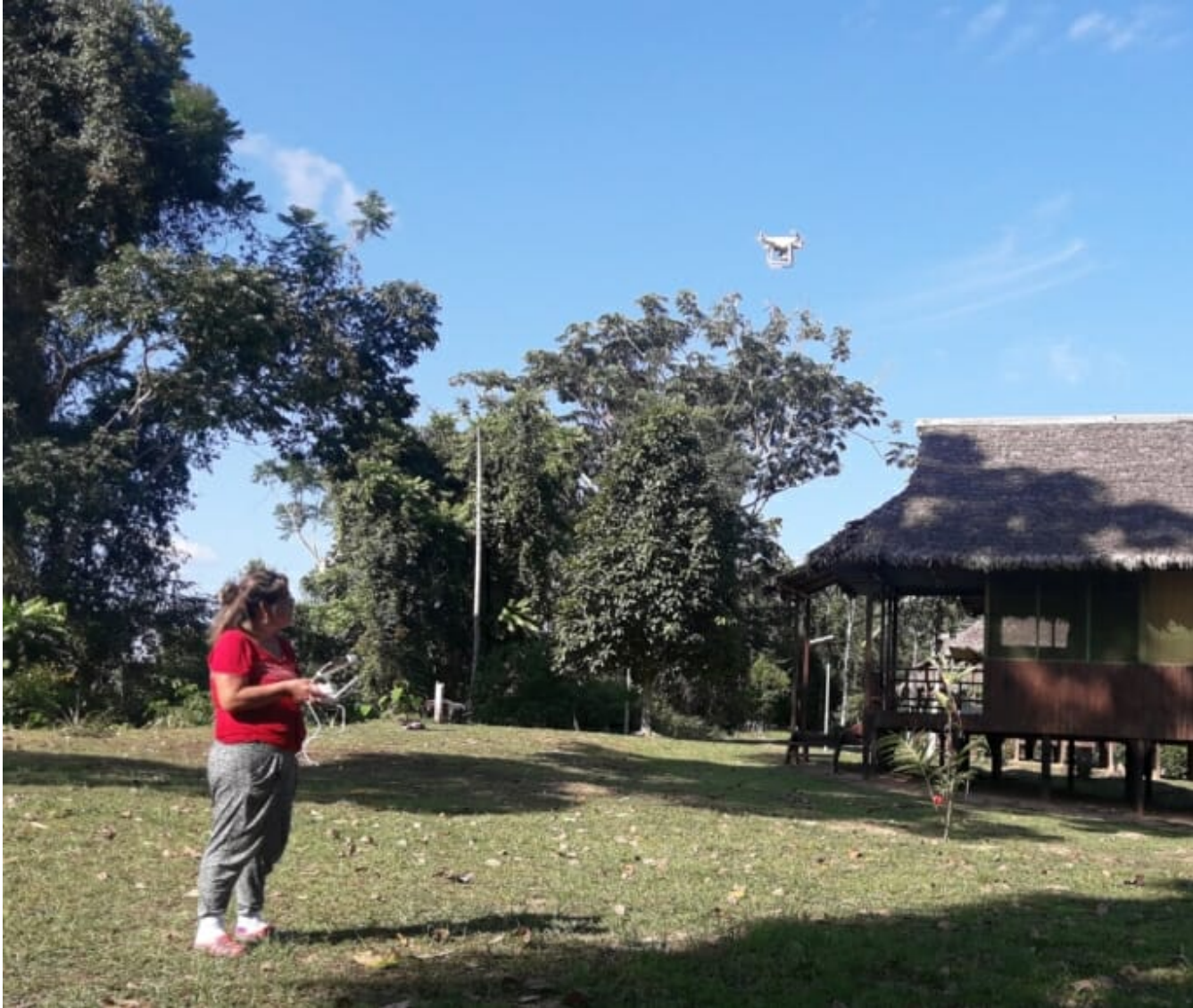
ACOMAT member flying a drone for monitoring.

Amazon Conservation , in collaboration with its Peruvian sister organization, is implementing a project aimed at linking cutting-edge technology (satellites and drones) with legal action , in the southern Peruvian Amazon (Madre de Dios region).