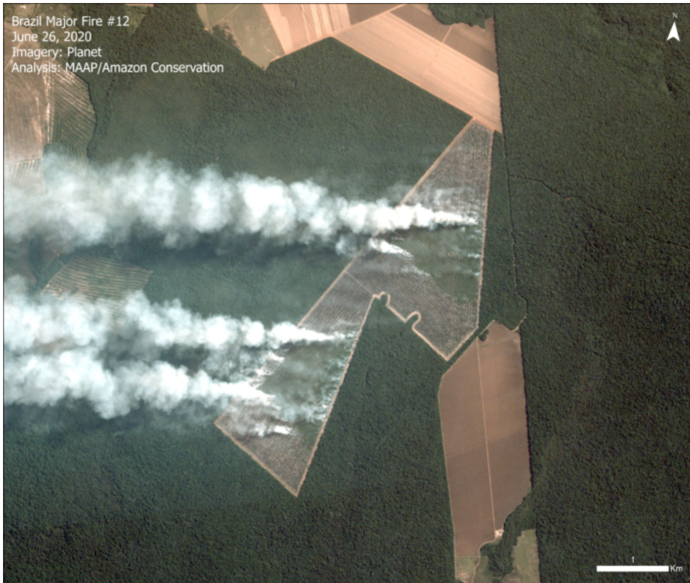
Image 1. Major fire burning recently deforested area in Brazilian Amazon (Mato Grosso).

We emphasize the following additional findings for the Brazilian Amazon :