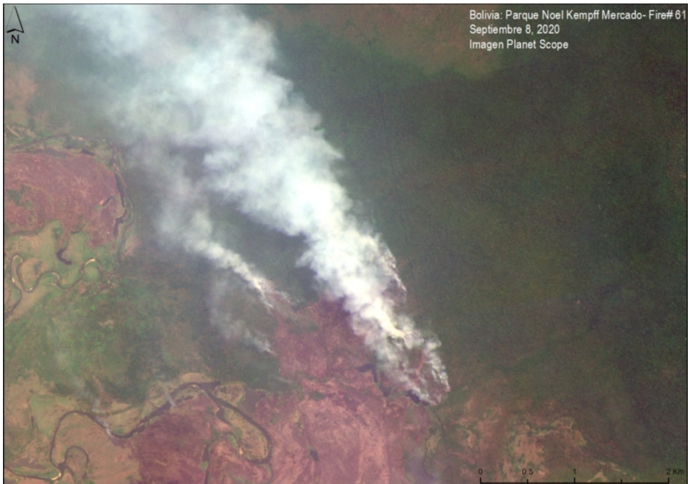
Image 2. Major fire in Noel Kempff Mercado National Park, in the Bolivian Amazon.

We emphasize the following additional findings for the Bolivian Amazon :