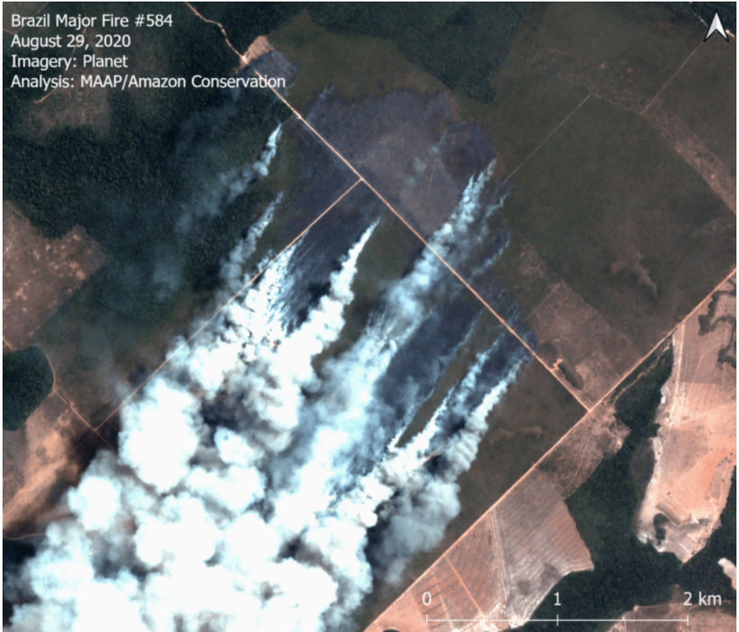
Brazilian Amazon Major Fire #584, August 2020.

August 2020 just ended its run as a severe Amazon fire month.