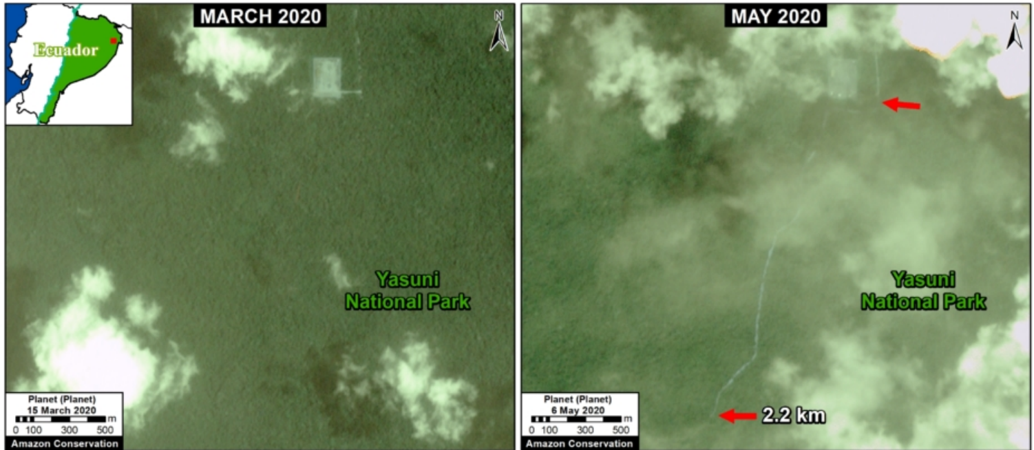
Image 1. Construction of a new 2.2 km oil access road deeper into Yasuni National Park. Click to enlarge .

Here, we show that, beginning in mid-March 2020 , we detected the construction of a new access road heading further south from the last platform (see Images 1 and 2 ). As of early May, this road construction was 2.2 km through primary forest.